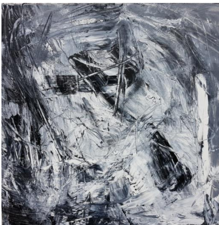
Benny Teo , Untitled , 2017 Oil on canvas, 41 x 41 cm

Benny Teo (b. 1988 -) graduated with a Bachelor of Arts (Honours) in Fine Arts from LASALLE College of the Arts, Singapore in 2013. The profound painterliness of British Master J. M. W. Turner is a palpable influence in his work. Utilising the expressivity of gesture, elements like line, shape and colour engage in dramatic exchanges to create an atmospheric and emotionally-charged space where the diaphanous and the concrete collide. Through a palette rich in tonal expansion and provocative brushwork that oscillates between a fluid, searching spirit and a bold, agitated character, Teo's work captivates with its intense pursuit of emotions, both raw and controlled; feelings and desires, freedom and entanglement translate into compelling interactions in pictorial space.