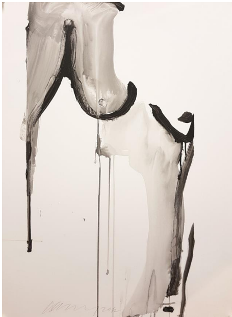
Wong Keen , Picture Writing 24 , 2012 Acrylic on archive paper, 94 x 64 cm

Wong Keen (b. 1942 -) grew up in a Chinese literati environment and was a highly acclaimed teenage painter in the early Singapore art scene. In 1961, he left for America after being accepted by the prestigious Art Students League of New York, making him the first Singaporean and among the earliest of Chinese artists to venture into the flourished post-war American art scene – then the most avant-garde art center in the world. Wong’s unique body of work, which encompasses oil, ink, acrylic and collage since the 1960s to the present, is a powerful embodiment of the elegant expressivity of Chinese ink wash aesthetics and Western Abstract Expressionism.