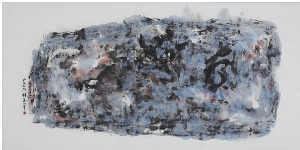
Gestures in Ink XI , 2006, Chinese ink and colour on paper, 68.6 x 137.2 cm