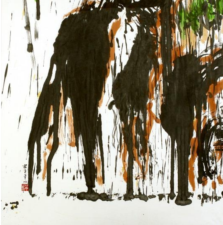
Gestures in Ink , 2006, Chinese ink and colour on paper, 130 x 130 cm

231 Bain Street Bras Basah Complex #03-39 Singapore 180231 | +65 6336 4240 | +65 9747 9046 www.artcommune.com.sg | UEN 200909244C