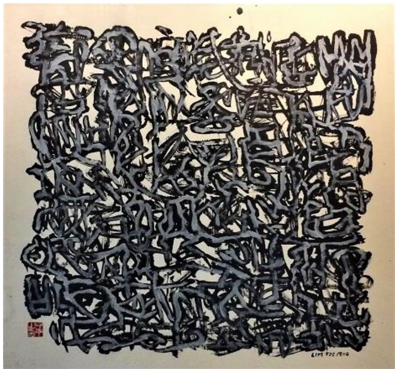
书画同源 #3 (Calligraphy and paintings are from the same source) , Undated, Chinese ink, colour, and acrylic on paper. 102 x 108 cm