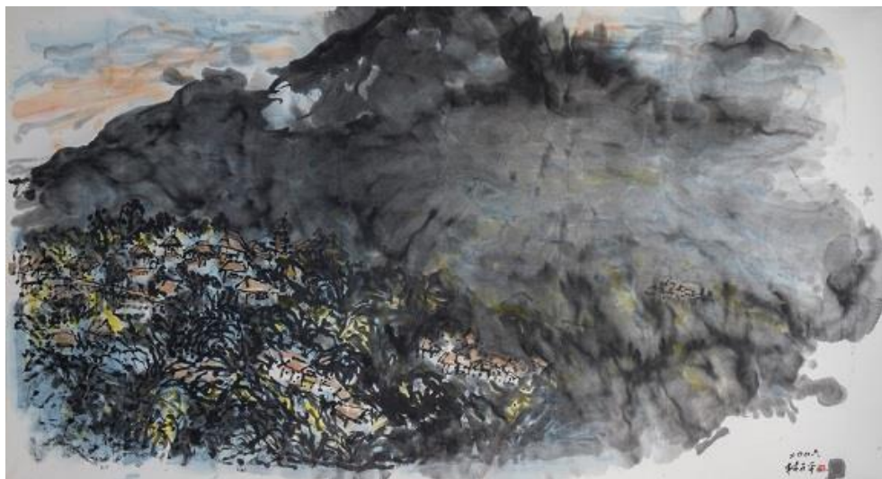
Gestures in Landscape II , 2004, Chinese ink and colour on paper, 82 x 151 cm

Here are the images to some of the selected exhibits: