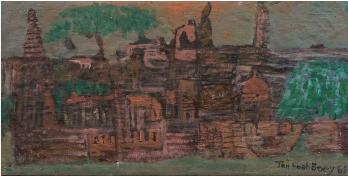
5. Angkor Wat , 1965, Chen Cheng Mei, Oil on canvas, 45 x 88 cm

of a camera. The resulting image is simplified yet expressive in form, and to a degree, reminiscent of a relief carving.