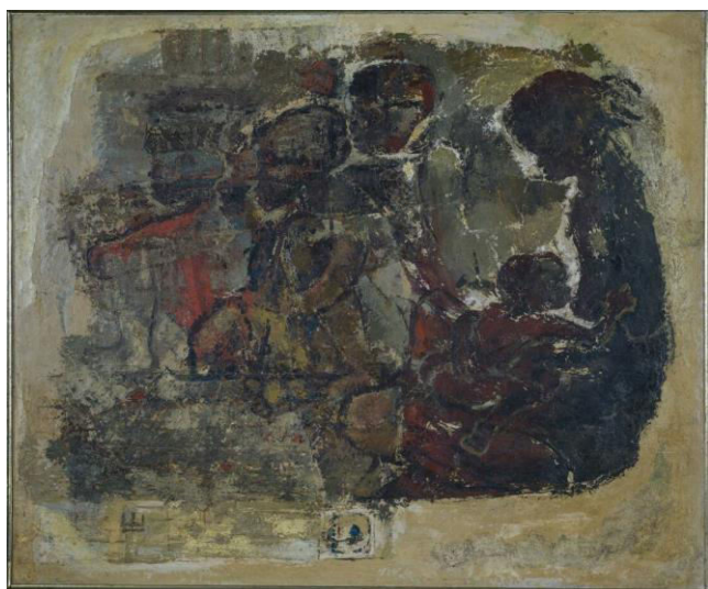
2. Untitled (Mother and Child) , c.1969 Yeh Chi Wei, Oil on board, 59 x 72 cm

Some of Yeh’s most successful paintings rely on his organic incorporation of these diverse influences, as seen in the work below (2), Untitled (Mother with Children) , composed sometime in the late 1960s. Spotting an entirely flat composition – as advocated in modern abstract painting – the work valorises the ‘mother and child’ theme in a Southeast Asian setting. The forms are reduced to simple shapes and lines, but the colours are evidently dense and striking. In particular, his unique palette knife sculpting evokes a mottled effect reminiscent of ancient stone rubbing, creating a new pictorial dimension for the oil medium.