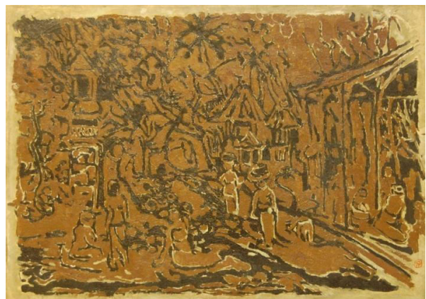
4. Bali Village , 1960s Lim Tze Peng, Oil on canvas, 75 x 102cm

For instance, when we compare Yeh's Malacca Bullock Carts (3) with Lim's Bali Village (4), the similarities in their executions of the oil medium become apparent. Each painting comprises a flat composition with elements being reduced to simple outlines; the choice of colour scheme and deliberate interjections of lines and spaces in stark white give the composition its 'framed' and 'weathered' look. Furthermore, each work is signed off with a painted Chinese stamp that resembles a 'seal' on a painting.