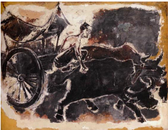
3. Malacca Bullock Carts , 1965 Yeh Chi Wei, Oil on canvas, 62.5 x 80.3cm

Unbeknown to many today, Lim Tze Peng concentrated in oil painting before the 1970s, and his work during this early period thoughtfully reflect commonplace activities or decorative customs observed in places such as Bali and Sarawak. In addition, his oil painting techniques in this early period might have received considerable influence from Yeh's innovative style.