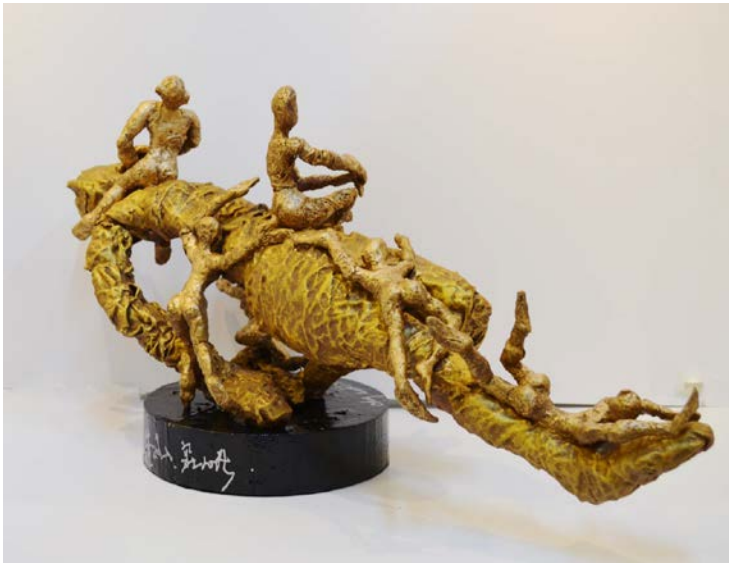
Chng Seok Tin, 靠山 , 2013, Sculpture, 76 x 37 x 23 cm