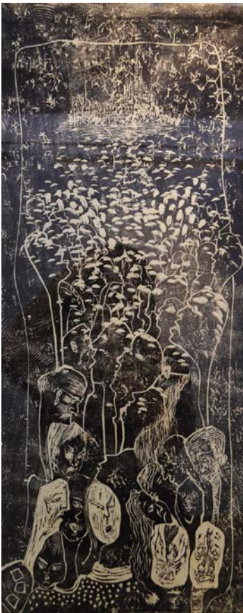
Chng Seok Tin, Dream Castle , 1988, Woodcut, 76 x 30 cm