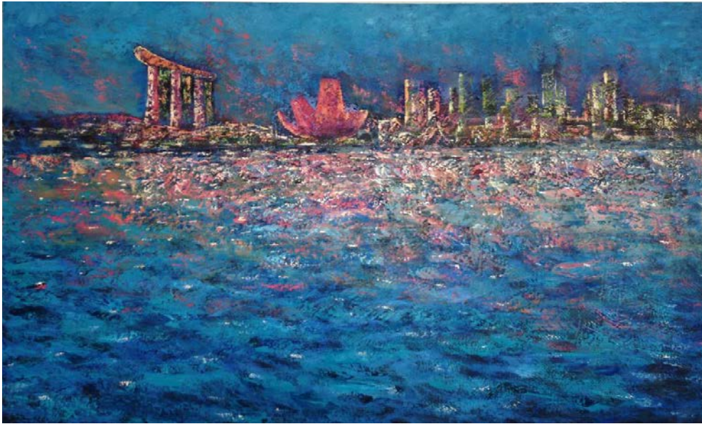
Wu Xue Li, Marina Sky Line , 2014, Oil on canvas, 120 x 200 cm

Here are the images to some of the artworks that will be on exhibit: