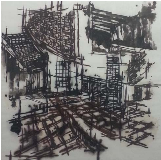
Untitled, 2007, Ink on Paper, 133 x 133 cm