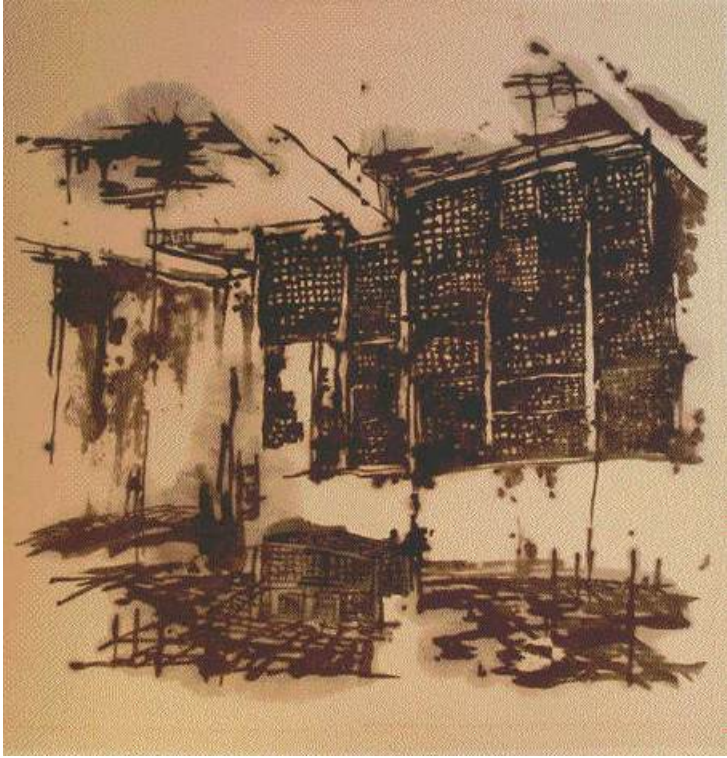
Factory Beng You, 2007, Ink on Paper, 150 x 150 cm