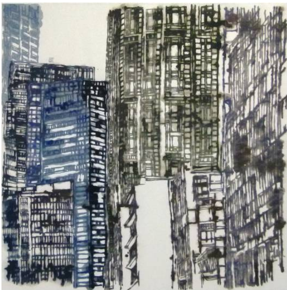
Untitled, 2007, Ink on Paper, 139 x 140 cm