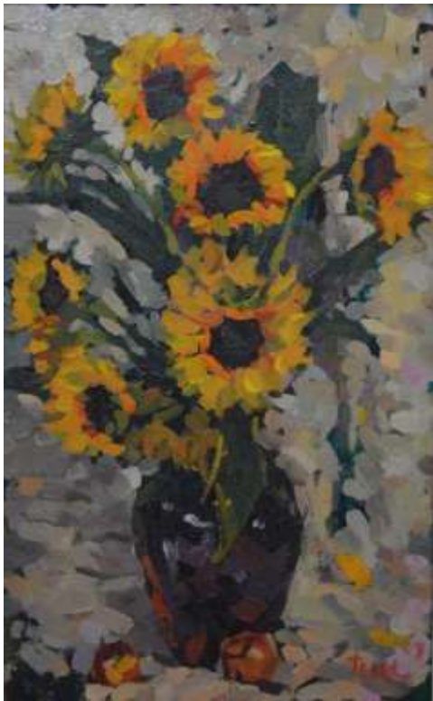
Teo Kim Liong, Sunflowers , 2009, oil on canvas, 61 x 38 cm