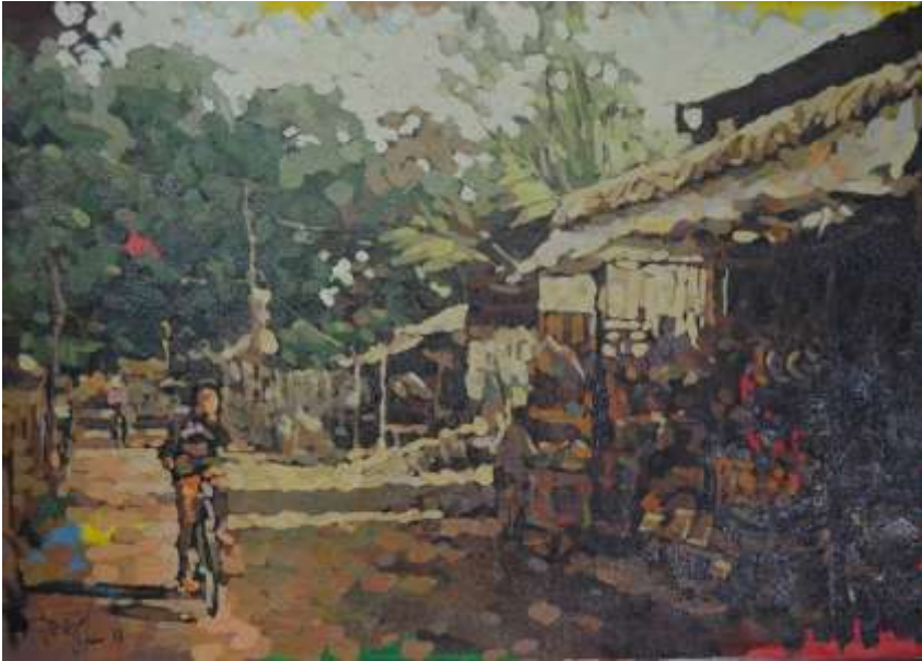
Teo Kim Liong, Cambodia Village Road , 2011, oil on canvas, 65 x 92 cm