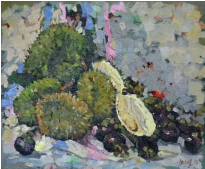
Teo Kim Liong, Durians , 2013, oil on canvas, 54 x 65 cm